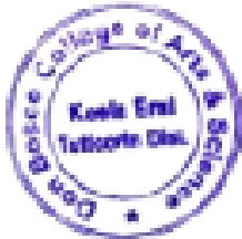
PRINCIPAL Don Bosco College of Arts & Science KEELA ERAL